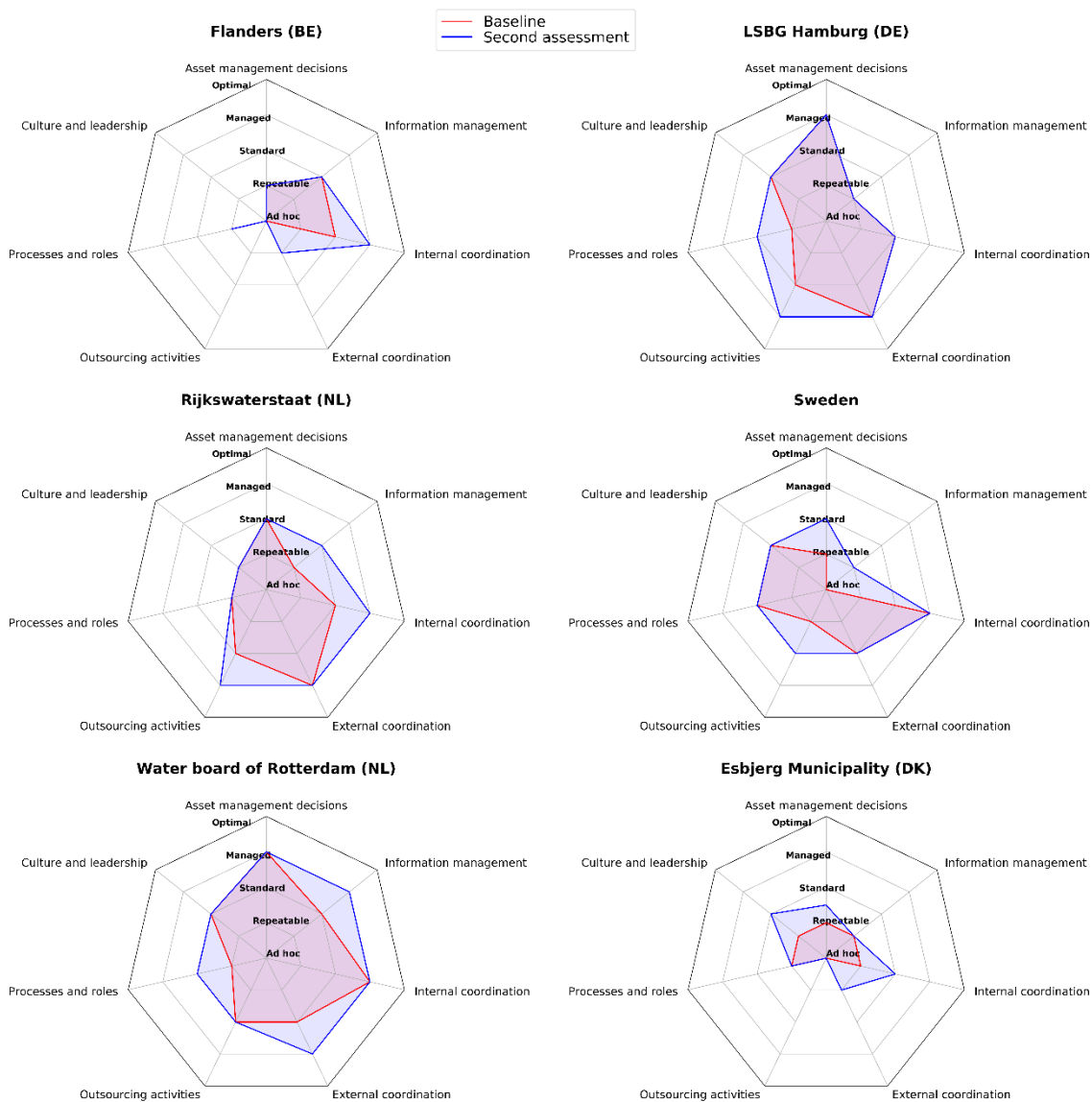
Figure 2. Results of the self-assessment of maturity across seven organizational dimensions during the FAIR project.

The maturity improvements for the Dutch partners (Rijkswaterstaat and HHSK) were reportedly the result of innovative FAIR insights, specifically on ‘information management’ and ‘external coordination’. The shift to a system-wide and strategic perspective, from a mono-perspective during FAIR, is illustrated by the changes to the planned investments in dike reinforcement by the Water Board, and investments in the approach to the Flood Protection Hollandse IJssel storm surge barrier by Rijkswaterstaat (see FAIR, [6] for more details). This shift to a system perspective gave a higher rating for external co-ordination by the HHSK between the start and end of the project.